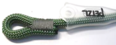
with cover "Plastic Sleeve" (open)